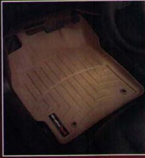
FloorLiner™ Applications to fit Cars, Trucks, SUVs or Minivans