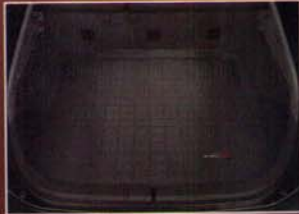
Cargo Liners Computer Designed Protection for Cars, SUVs and Minivans. Available in Black, Tan or Gray