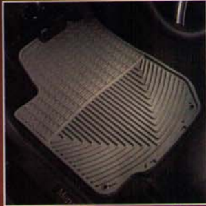
All-Weather Floor Mat Rubber Floor Mats for Virtually Any Cars, Trucks, SUVs or Minivans! Available in Black, Tan or Gray