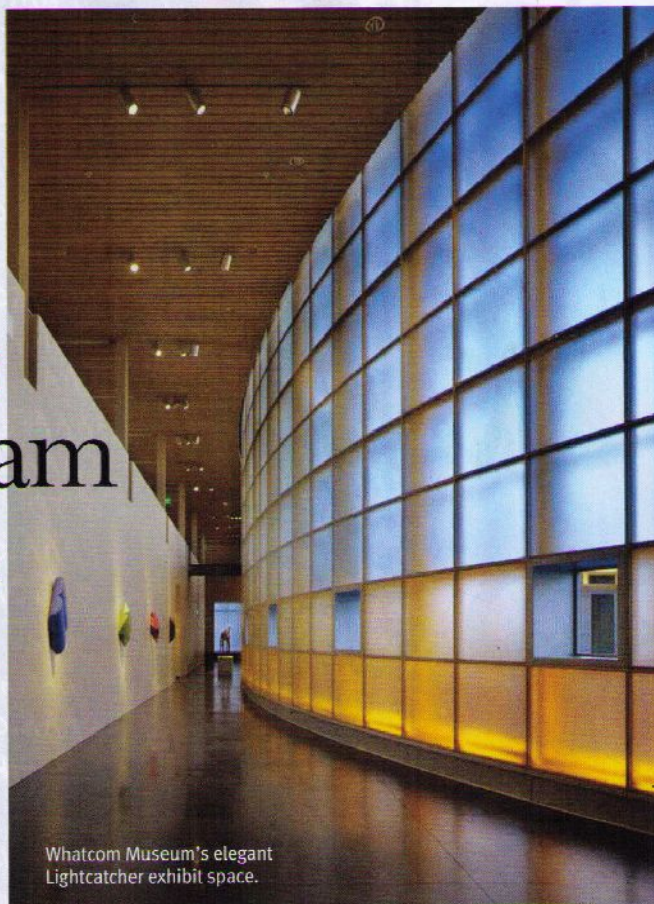
Whatcom Museum's elegant Lightcatcher exhibit space.

W hen you need a break from winter thrills on the slopes of Mount Baker, you can head down the hill and in from the chill in Bellingham's cultural arts district.